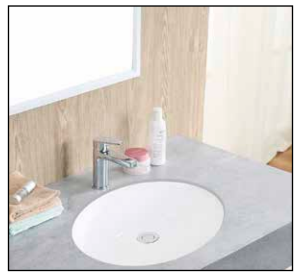
Installed Product Image

Please note: All porcelain sinks are fired at a very high temperature; final dimensions may vary slightly.